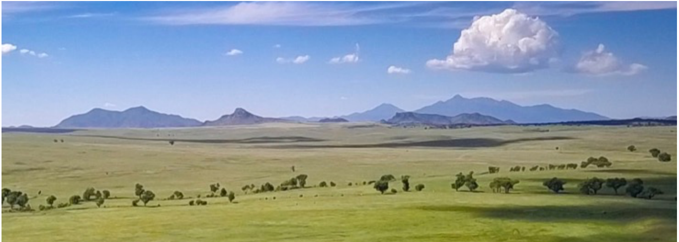
Red Mountain - Saddle Mountain and Mount Wrightson on the horizon of J2 Ranch Estate North